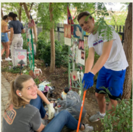
Las Vegas Community Healing Garden - Fall and Spring Maintenance Days