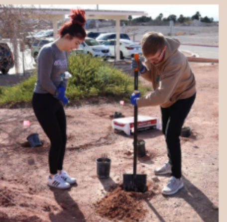
Centennial Hills Park Native Habitat Pilot Site