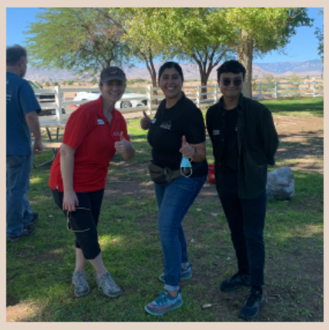
Floyd Lamb Park at Tule Springs - Centennial Hills Park - Native Pollinator Habitat